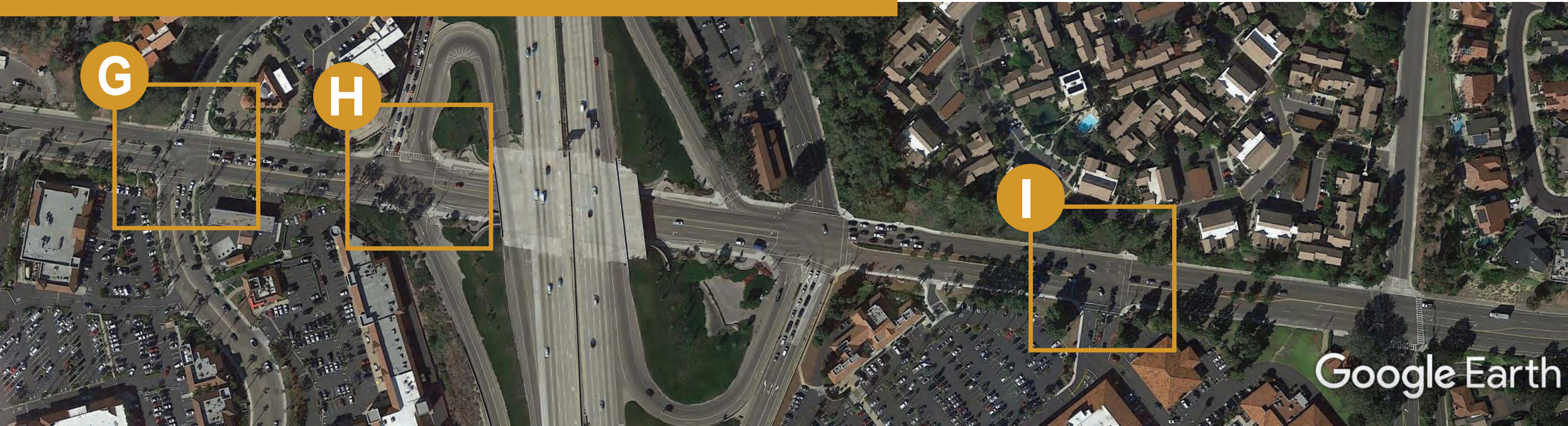
SOLANA BEACH LOMAS SANTA FE CORRIDOR FEASIBILITY STUDY