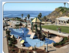
Parks & Recreation