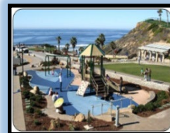
Parks & Recreation