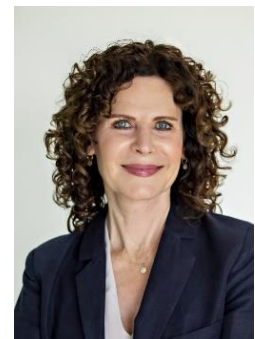
La Honorable Lesa Heebner Alcaldesa, Ciudad de Solana Beach