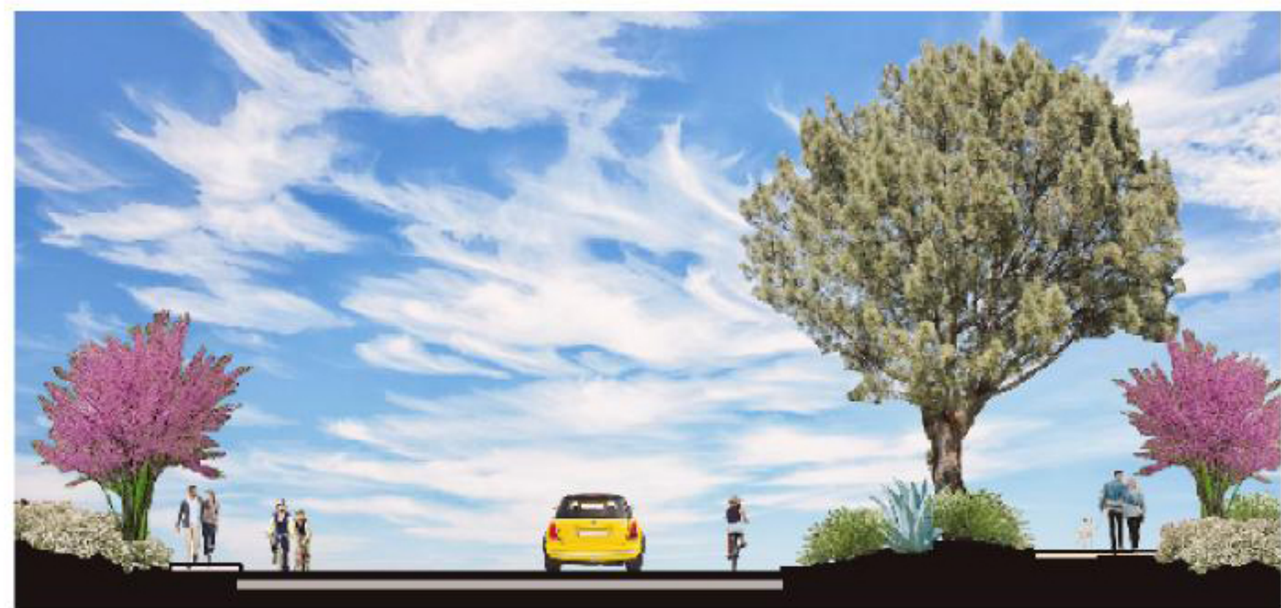
10' ROW | 40' ROAD | 34' GREENWAY