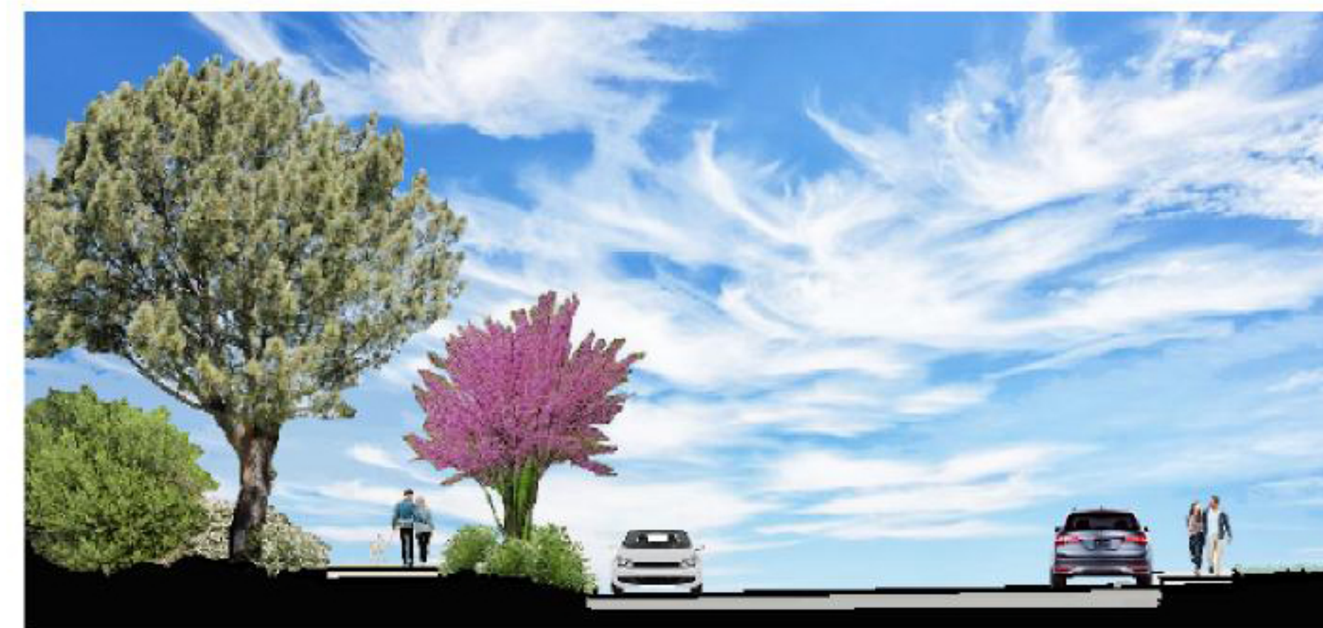
34' GREENWAY | 40' ROAD | 10' ROW