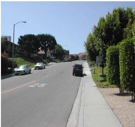
The above street is 40 feet wide curb to curb with parking available on both sides.

The Neighborhood Traffic Management Program is a tool created to assist City Staff in helping communities manage traffic through their neighborhoods. Managing traffic by changing driver behavior can help improve safety for drivers, as well as pedestrians and cyclists. Due to the diverse road configurations throughout Solana Beach, devising an extensive program to manage neighborhood traffic has become a necessity to address community concerns regarding increased traffic volumes and excessive speeds. Solana Beach's residential streets range from 40+ feet wide with curb, gutter, and sidewalks to roads that are under 26' with no street improvements. Although both of these types of streets may have similar traffic issues, the tools necessary to address the neighborhood concerns may be drastically different.